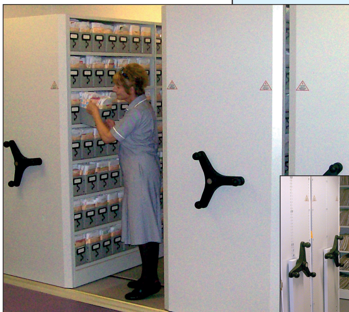
The Consulting Room System