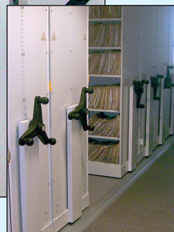
The A4 Option